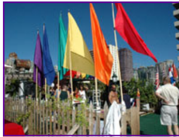
Biggs PRIDE Deck Party