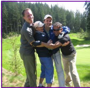
Cutting Edges Team at AIM to AID